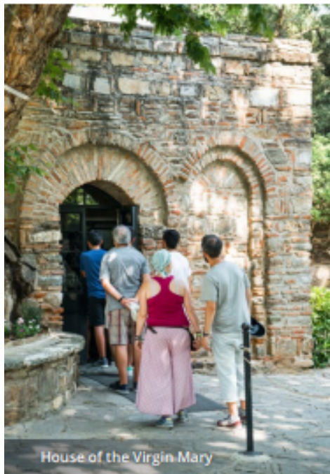
House of the Virgin Mary